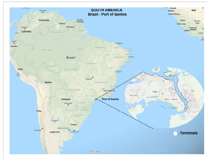
Fig. 2: Location of the eight terminals in the Port of Santos.