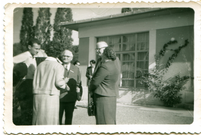
Fig. 2. A picture showing Kalmár and Church, taken by András Ádám at the Colloquium on the Foundations of Mathematics, Mathematical Machines and Their Applications, Tihany, 11–15, September 1962. (picture published with Ádám’s approval.)

of Cybernetics. 3 In 1963 he founded the Cybernetics Laboratory , which grew rapidly after the arrival of the M-3 computer to Szeged in 1965, and later became the first computer center outside the capital. In 1967, another research group was founded in Szeged to conduct research in mathematical logic and automata theory.