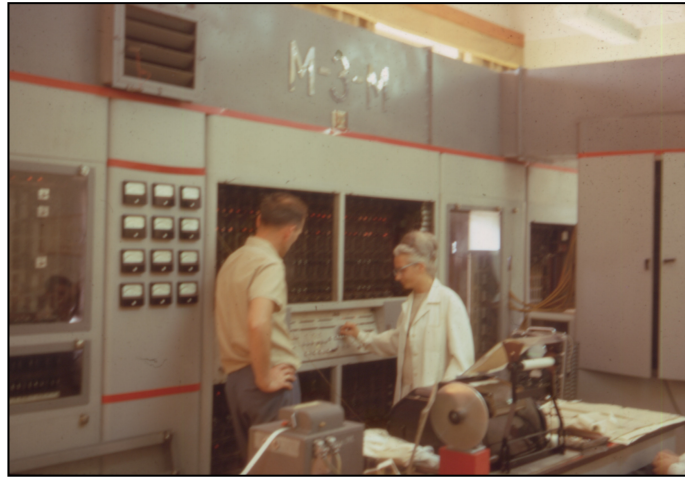
Fig. 4. Tibor Varga and Ilona Berezki at the M-3 computer in Szeged, 1967 [38].

hand, a standalone major could be appealing to those students who were interested in engineering or natural sciences but not in becoming teachers.