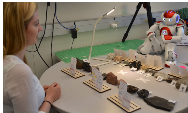
Figure 1: Setup of the game LinkIt!, designed to study human and robot behaviour, and played by participants in the study.

Curiosity in Social Robots: Design, Perception, and Effects on Behaviour. In CHI Conference on Human Factors in Computing Systems Proceedings (CHI 2019), May 4–9, 2019, Glasgow, Scotland, UK . ACM, New York, NY, USA, 12 pages. https://doi.org/10.1145/3290605.3300636