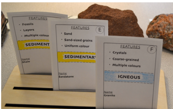
Figure 2: The ground truth cards used in the game.

The aim of the game is for players to link each other’s rocks by finding those with a common feature or type. Each round starts with the student taking the top card from an upside down deck placed in between the players. This card