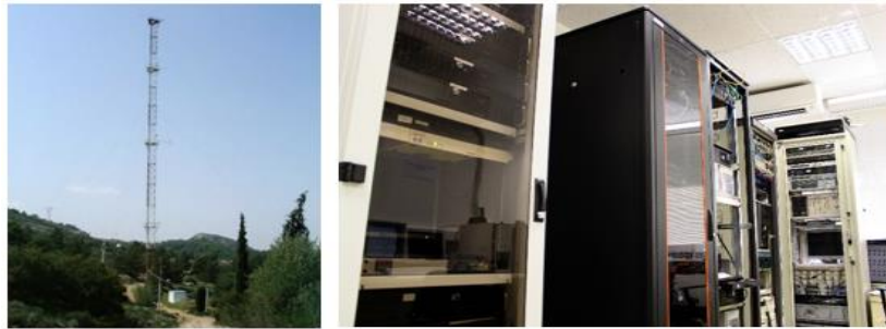
Fig. 2. (left) High (70m) Mast within the Campus of NCSR D, Hosting the Macro-Cell Base Station; (right) Cloud/SDN Infrastructure in NCSR D

5510 Firewall). Finally, the NCSR D site connects to the Internet via the national NREN (GRNET), using a dedicated hardware firewall whose rules are fully customizable. VPN access is possible, via SSL (Secure Socket Layer) and IPSec (IP Security) connections.