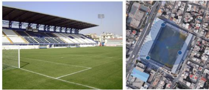
Fig. 4. (left) Egaleo Municipal Stadium; (right) Placement and coverage of radio cells

to host edge services enable a new business model, under which the CESC infrastructure is owned by the stadium operator (rather than by MNOs), who, in turn, leases slices to MNOs, MVNOs and enterprise users. The stadium is connected to the main site of the testbed (NCSR “Demokritos”), where the core functions are expected to reside, with a backhaul point-to-point microwave link. A VPN (Virtual Private Network) over the Internet also exists, yet only as a fall-back solution.