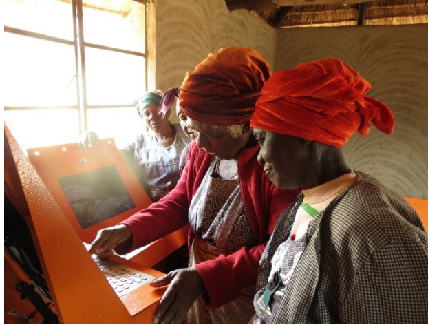
Fig. 1. Women using the ICT artefact in Mafarafara