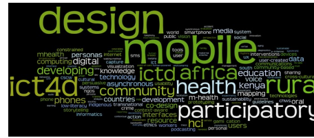
Figure 3. SADC Kenya and Uganda

In terms of the challenges, Table 2 demonstrates a large overlap between the previously-proposed categories [1, 2, 3] and our survey responses. This confirms the relevance of the following challenges for Southern driven HCI: