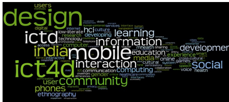
Figure 2. Global papers

We compared the keyword frequency for the global set (114 papers) with the A_SE set (56 papers) and depicted the results in Figures 2 and 3, respectively. That excludes the review papers, which are not country based, and inter-country studies. The terms design , mobile , ict4d , ictd and community dominate both sets. This highlights the importance of community and design-focused research, with mobile phones as the central technology, in HCI4D research (as supported by our survey). The terms participatory , rural and health feature more prominently in Figure 3. The findings reveal a diverse range of philosophies and methodologies; both the A_SE set and global papers have an action-orientated, design and development focus with due recognition of the user communities. This places HCI4D researchers in a strong position to respond to the calls for practice-led research [67].