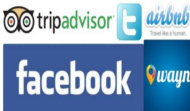
Fig. 2. Five best social network sites used in travel and tourism [15]

Of course, the above mentioned most popular SNSs may be used for promoting travel and tourism. However, they do not focus on travel and tourism like some other sites. One of the rankings of the best SNSs in the field of travel and tourism [15] features at the top two general SNSs (Facebook and Twitter), which are followed by WAYN, Airbnb.com and TripAdvisor. Ali and Frew [11] list among the most popular travel-related SNSs WAYN, Couchsurfing, Travelbuddy and Travellerspoint. Figure 2 below illustrates the five best network sites used in travel and tourism.