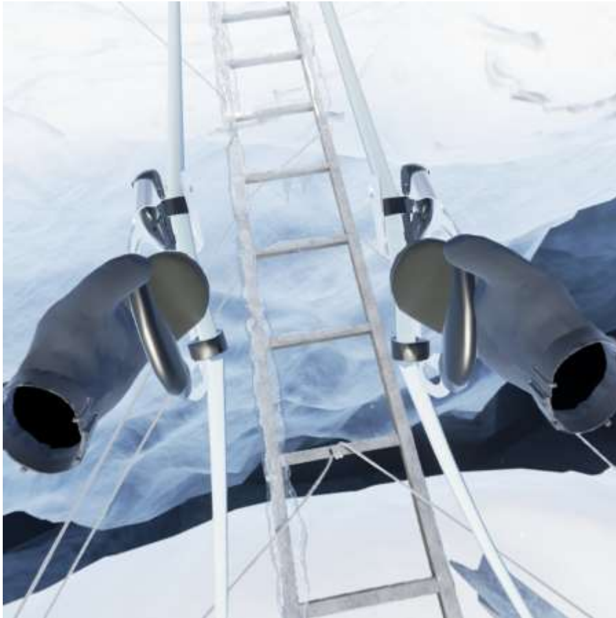
Fig. 2: A scene in which the user crosses a chasm using a ladder.

In every scene, the user can freely control their perspective in the virtual world by physically moving their head. In the scenes that require activity, the user's hands are represented by virtual mittens whose positions match the positions of the HTC Vive's hand-held controllers. Each scene that can only be observed causes an automatic transition to the next scene as soon as the former is complete. Each scene that requires interaction ends when the user performs a specific gesture in a particular context (e.g., waving in the direction of a virtual character); the next scene then begins automatically. Within an active scene, the user can use their virtual mittens to grasp various virtual objects, including ropes across a chasm and the rungs of a ladder (the user "climbs" the ladder by reaching for and grasping higher rungs to raise their virtual body; the user's feet are not tracked by the HTC Vive).