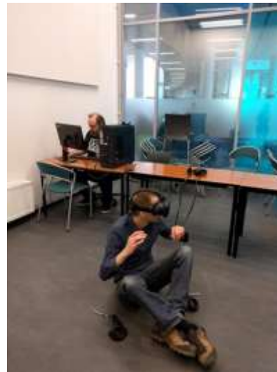
Fig. 3 and 4: The user testing area (Left) and a user participating in the VR experience (Right).

The execution of the user evaluations is shown in Figure 5, by using an early version of the RAMES framework [11].