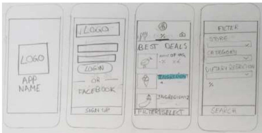
Figure 1: Illustrations of the low-fi prototypes from one of the groups.

Figure 1 shows illustrations of the paper based prototype of the first four screens the users meet from the student group assisting in buying food at the grocery store.