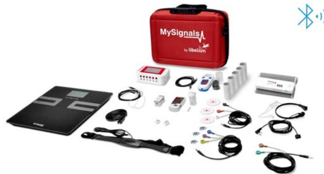
Fig. 1. The MySignals SW BLE Complete Kit.