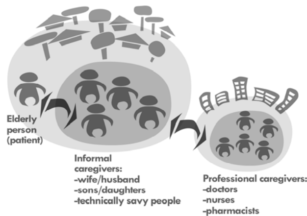
Fig. 2. Stakeholders involved in the African rural village scenario and communications among them.