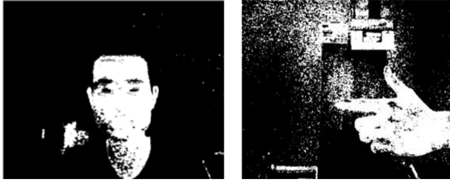
Fig. 3. Binary image

In order to reduce the influence of noise on the image, image differential processing and filtering. The result is as shown in 4: