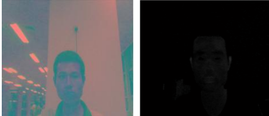
Fig. 1. NTSC brightness image(face)

The experimental image set has a total of 200 pairs, and is represented by experiments in both face and gesture. After detecting the NTSC image, one of the images is taken as the luminance frame. The image results are shown in Figure 1 and Figure 2.