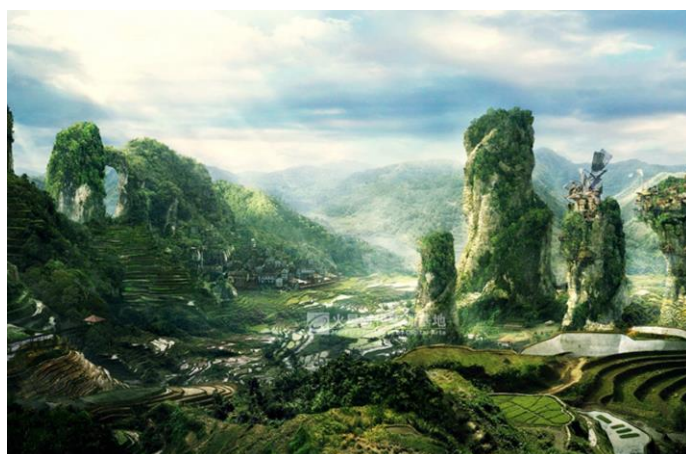
Fig. 3. A scene model (Author: Zhu Yihan, a student of Mars Time Inc)

The data for future planning is mainly explained by various models. These models include scenes, Agricultural facilities, crops, animals, and so on. It is often needed to design these models, rather than using photos, with professional software. The picture below is a scene model designed by a student of Mars Time Inc.