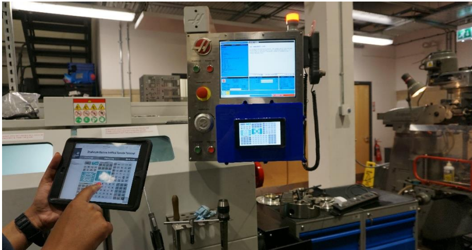
Fig. 3. Remote maintenance interface mounted on a HAAS control panel.

device can configure itself over a foreign network, given that it has Internet access. An Android® tablet was used to control the CNC machine over the Internet using the Web Interface shown in Fig. 2. Proximity to the machine is not required and that the machine could, in principle, be operated from anywhere in the world. To test the physical device, inputs were actuated from the front panel as shown in Fig. 3. All the trial commands were recorded on the log page along with user comments.