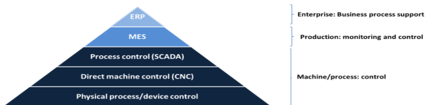
Fig. 1. Automation pyramid

The automation pyramid classifies industrial systems into distinct layers as can be seen in Figure 1 [4, 11]. On the uppermost level, ERP takes on the role of the transactional backbone of all business processes and databases of a company [12].