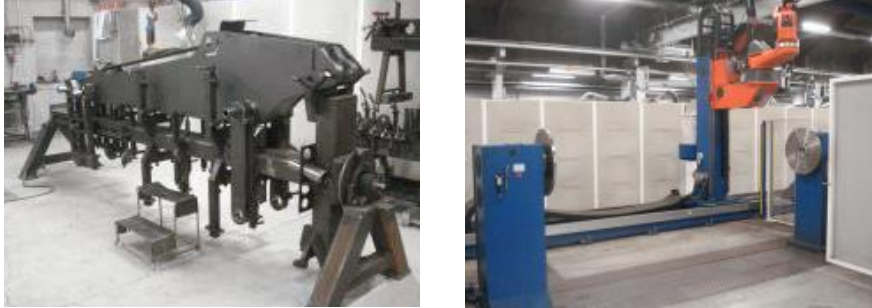
Fig. 1. The existing, conventional welding process sequence

Tack welding of large steel plates requires large and heavy fixtures and a change from one variant to another requires change of fixture. Therefore, the case company experiences many time consuming changeovers across the high variety of product components, as there is typically one unique fixture per product component in both processes illustrated in Fig. 1 . A changeover can account for as much as 20 % of the actual process time of the tack welding process. However, the major cost driver related to auxiliary equipment (e.g. jigs and fixture) is the New Product Introduction (NPI) cost related to design, manufacturing, and installation, and the following cost of storing and maintaining such equipment.