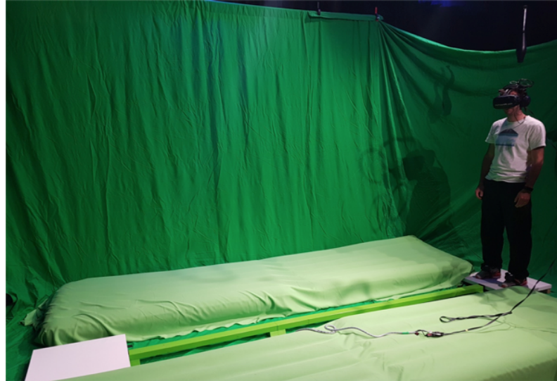
Fig. 1: Wearing a HTC Vive headset and trackers on both ankles, in reality the user balances on a thin bar between two platforms.