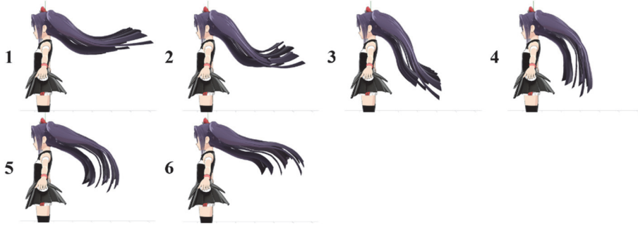
Fig. 2. Example of one cycle of hair motion with s = 1.2 , k = 1.0 , a = 0.8 , and T=0.45 . The model “Tune-chan” was provided by G-Tune ( http://www.g-tune.jp/campaign/10th/mmd/ ).

engine is 27.1^\circ . These results indicate that our method provides hair motion that is similar to that of hand-drawn animation and, as far as the above case is concerned, the motion is more accurate than that given by a physics engine in animation software.