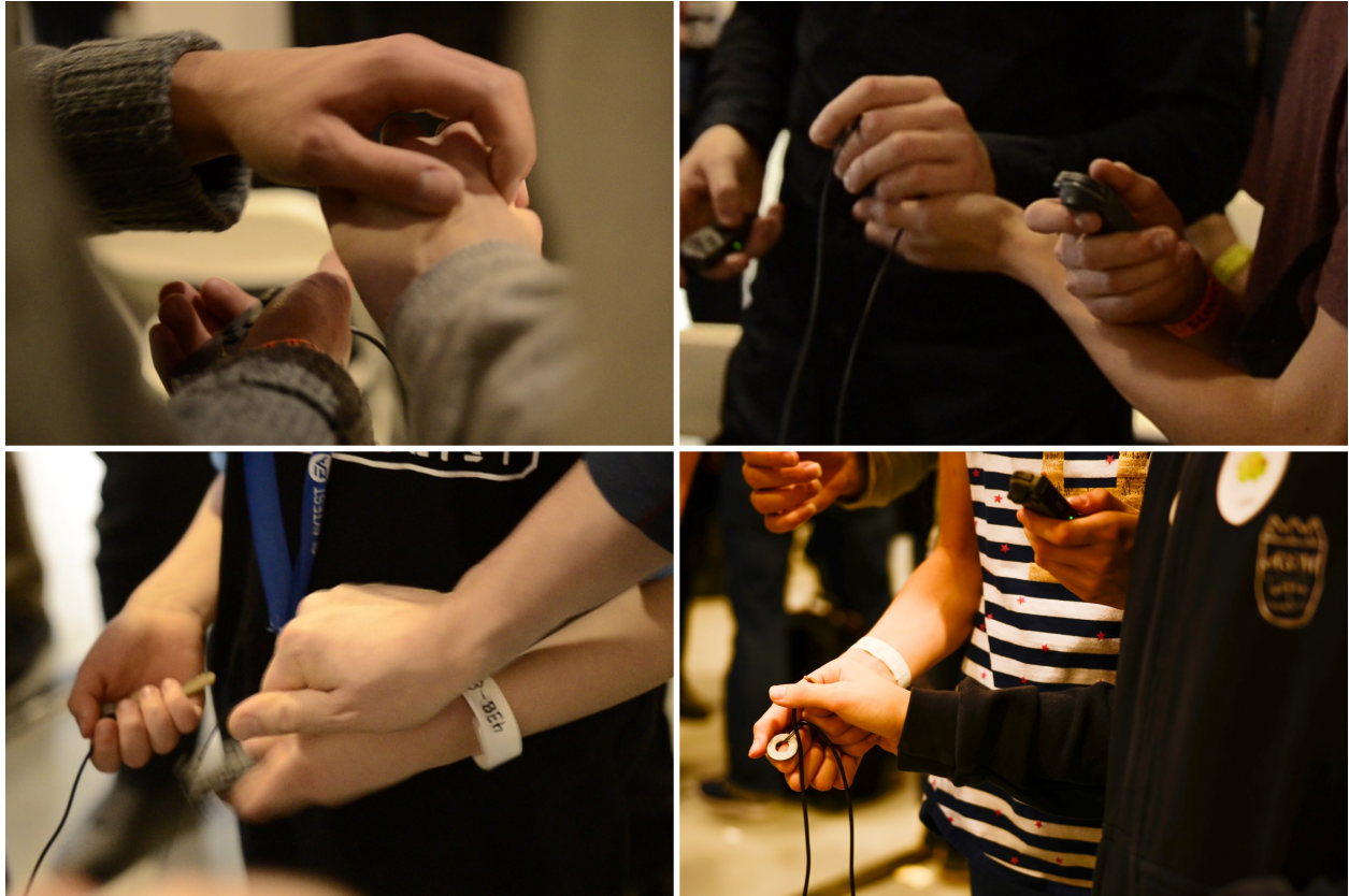
Figure 3. ‘Wall Mounted Level’. Showing player interactions and use of touch. November, 2017.

physical quality of the sculpture, the verbal communication and physical coordination that takes place between the players is especially important to us in terms of human-facing interactions as it extends the narrative of ‘reconciliation’.