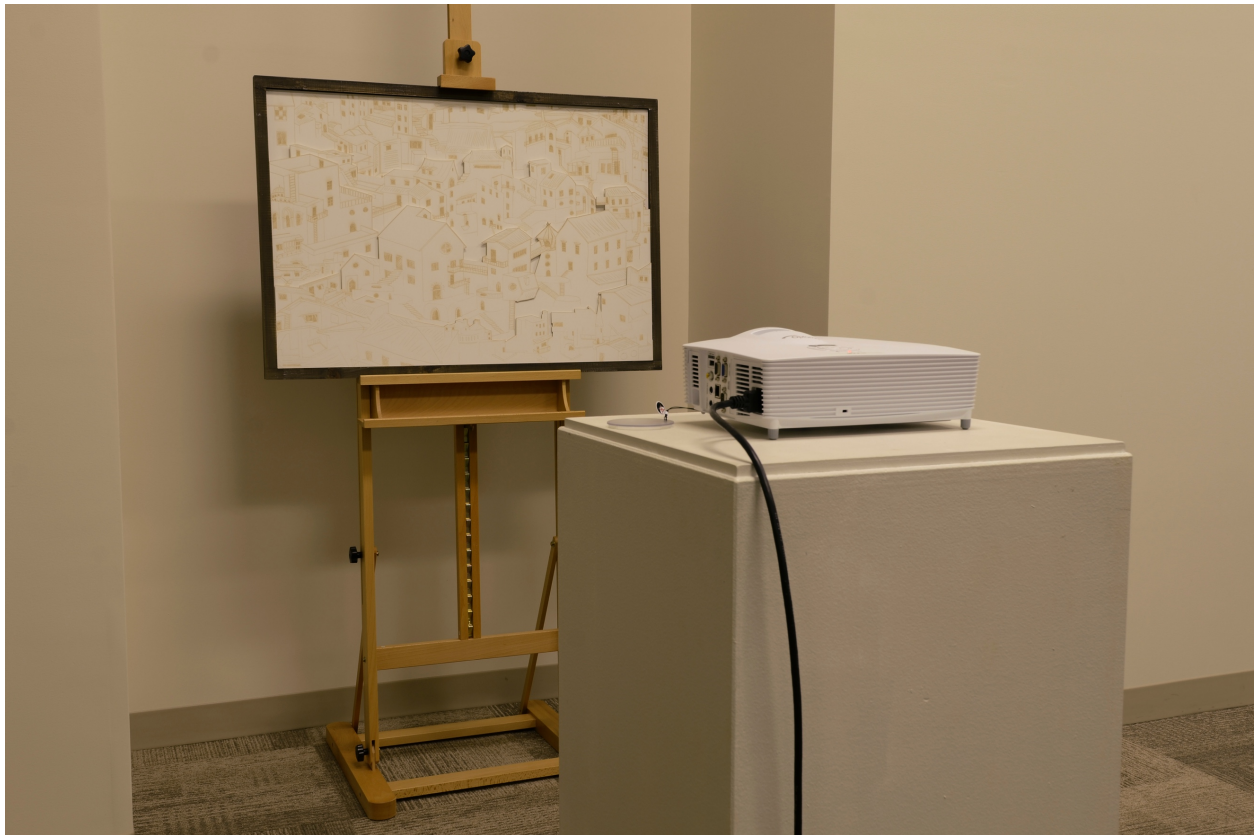
Figure 1. 'Wall Mounted Level' (24"x36", laser-cut illustration board and paper). Sitting on an easel in front of projector. Testing dimensions and footprint of entire setup. November, 2017.

The game environment is a hand drawn cityscape that was laser-cut and assembled into a paper sculpture. Serving the metaphor of the characters' internal struggle, we decided to further fragment the sculpture and create a deeper relief out of it. Other materials that we considered for the construction of 'Wall Mounted Level' included cardboard, chipboard, wood, and acrylic plexiglass, but ultimately, we favored the inherent quality of paper as a tangible, vulnerable, interactive medium.