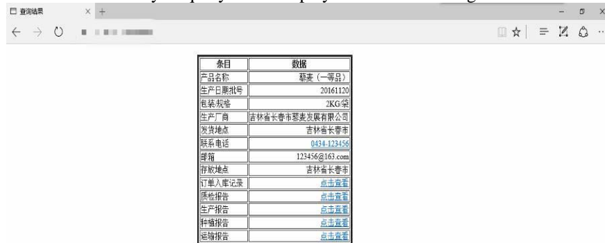
Fig.3 The query result

The traceability of query result display as shown in the figure below: