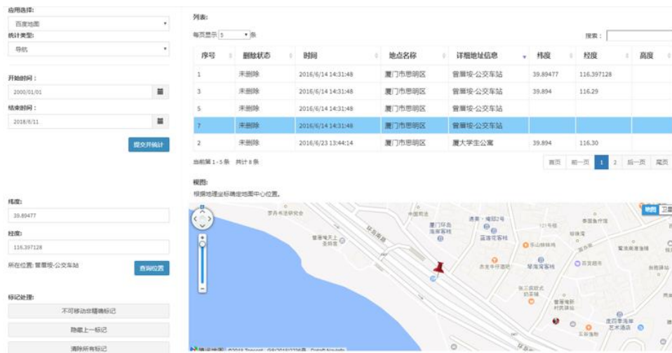
Fig. 3. System operation result graph

The operational effect of the system is shown in Figure 3: