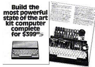
Figure 3: Microbee advertisement

The Microbee designers were thinking of both home and education markets and it wasn't long before the first Microbee contract was let for New South Wales schools. This was soon followed by Western Australia, South Australia, Queensland and Victoria. Some were also sold in Scandinavia, Asia and Russia [27]. By the mid-1980s more than 70,000 Microbees had been sold and over 3,000 Australian schools,