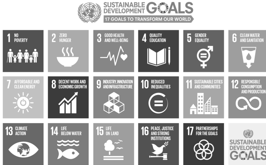
Fig. 2. United Nations Sustainable Development Goals

ICTs are seen as central to achieving the Sustainable Development Goals (SDGs) and are specifically mentioned in Goals 4, 5, 9, and 17 and their targets or indicators (see Table 1).