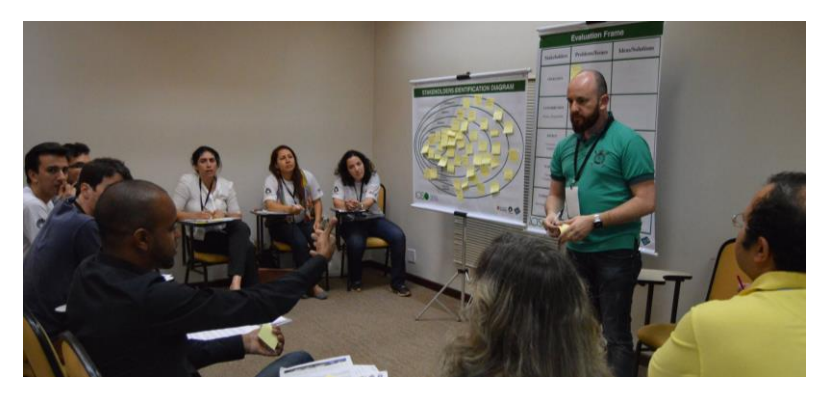
Fig. 1. Group discussion during the first workshop: SID (left) and EF (right).

The first workshop resulted in the identification of stakeholders and related problems and solutions. One of the SIDs shows a general concern with safety: smoke detectors, earthquake alarms and security cameras were some of the ideas for the source information layer of SID. The other SID layers from the first workshop had many contributions directed to pets: pet's cage and accessories (contribution layer), health insurance for pets (source layer) and animal welfare department (community) are some of the results. Fig. 1 illustrates a moment from the first workshop.