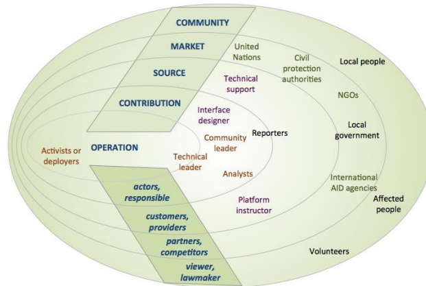
Fig. 2. - Stakeholders Identification Diagram

The stakeholder analysis evidences the complexity and diversity of actors involved with the socio-technical system, enabling a systemic view of the forces (expectations, concerns) from the interested parties [9]. All the interested parts mentioned by the community leaders during the interviews are represented in the layers of the Stakeholders Identification Diagram (SID) [9] (Figure 2).