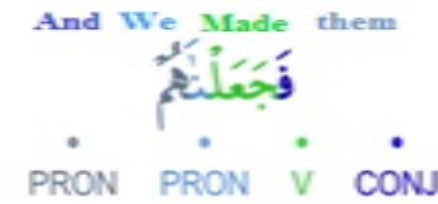
Figure 1: Example of the Arabic language difficulties: the tokenization problem.