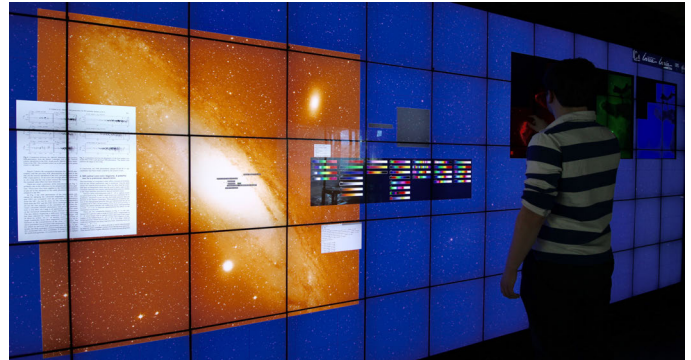
Figure 2. FITS-OW on WILDER showing multiple FITS images, the result-set of a SIMBAD query restricted to observations about galaxies, basic measurements for galaxy M31, a page of a research paper discussing that particular galaxy, and the color map selector.