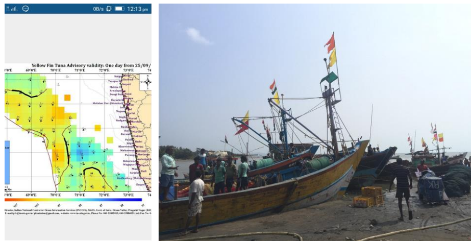
Fig. 1. A screenshot of the mKrishti app with indications to where finding fish (left) and Fisheries landing center in Alibaug village (right).

Examples like this leads us to believe that a single app used to support rescue and assistance operations in Italy can improve the whole organizational structure favoring better cooperation between all operative units and government agencies in order to enable more equal immigrants' treatment and distribution among all European countries.