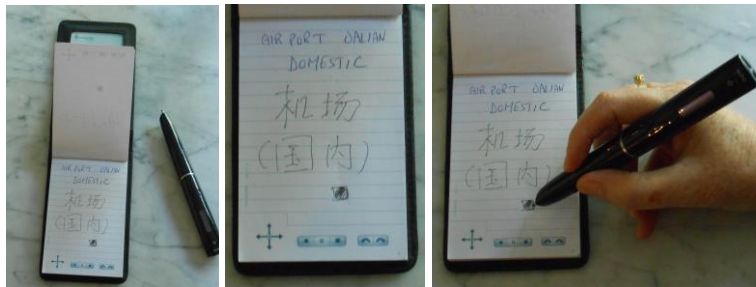
Fig. 12 and 13 . Lifescribe Notebook and pen; Fig. 13 . English phrase and written and spoken translation; Fig. 14 . Pointing to the scribbles triggers the sound track.

We teach in multiple countries. In the case of China, we know that outside the Universities there is a language problem. Most people we need to talk to, like Cab drivers or waiters in restaurants, only communicate in Chinese and sometimes they cannot read complex phrases. We use our Lifescribe pen and notebook (Figure 12) and ask our students to translate our written notes to written Chinese, at the same time pronouncing this translation (Figure 13). Whenever we need to communicate we find the right page in our notebook, and point to the translation – if that does not work we point with our pen and the system will pronounce the sentence. Interestingly, anybody who has never seen or used this before considers the pen to be the resource of the sound. For the regular user, the location on the right page in the notebook is the location where the pronunciation is, see Figure 14. And at the same time, the regular user will probably use the pen as input device for his regular computing devices like phone or laptop and network connections where the scribbles and the accompanying sound will be stored and often shared.