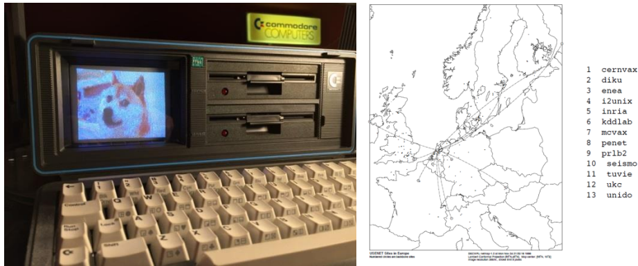
Fig. 5. Commodore SX 64-1, and Fig. 6. European network in 1986.

domain and we used one file to communicate. We knew the path and the location of the machine was, and we knew where the programs and the data were that we were collaborating on.