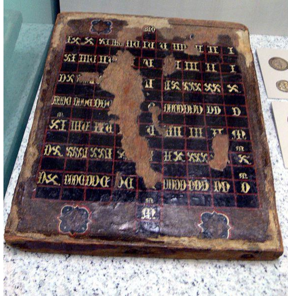
Fig. 2. Abacus from 1340 Upper Italy, German Historical Museum, Berlin.

In summary: both for information and information processing devices there has been clear physical locations to keep them and to use them.