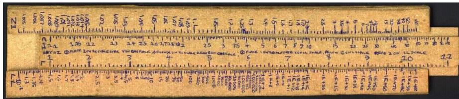
Fig. 1. Slide rule, hand-made made by Robert Munafo at the age of 14.

Information processing often required calculations. In due time experts developed tools like the slide rule. Figure 1 shows a recent one, still hand-made [1]. Another device is the abacus. Figure 2 shows a historic example from around from 1340, Upper Italy, currently in the German Historical Museum Berlin [2]. For complex calculations experts either made their own tool, owned one, or needed to know where to find one.