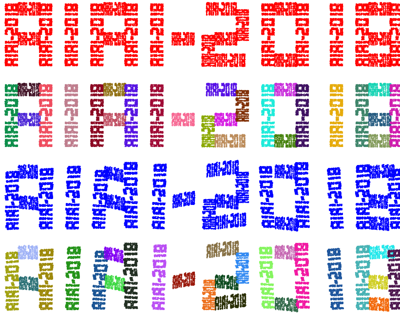
Fig. 3. Example of the AIAI-2018 fractal (from top to bottom): original image in red, original image with different colors for each contractive function, reconstructed image in blue, and reconstructed image with different colors for each contractive function.