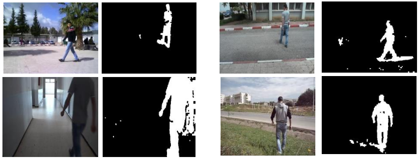
Fig. 2. Background subtraction results in personnel video database in both indoor and outdoor environments