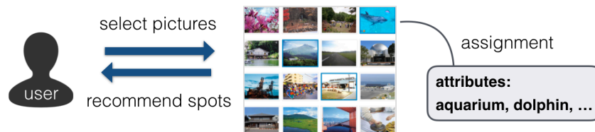
Fig. 1. User interaction on the proposal system.

In this system, 16 image photos of different sightseeing destinations are displayed in the 4x4 boxes, and a user is to select 4 of them (Fig. 1). This process is to be repeated 10 times with different sets of image photos. This interface realizes the simplicity of extracting the users' preferences. The photos displayed corresponds the node of the preference model mentioned in the next section, and as images are selected, the parameters of the node increase. Moreover, as the image photos are displayed in the manner that it covers the entire categories the system deals, it can be expected that the users would discover their new preferences they were not aware of themselves. The kinds of photos to be displayed will be mentioned in the section of the database.