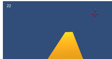
Fig. 2. Playful VR test application. Implemented in Unity3D.

Incoming rotation values are interpolated to avoid jitter in movements and mapped to the rotation around vertical or horizontal axis of the virtual board according to the physical manipulation of the real wooden board. The application allows for a forward, as well as for a sideways stance orientation. The system was used in conjunction with an Oculus DK2.