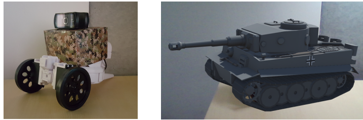
Fig. 4. Robot fitted with AR-marker shell and webcam (left) and overlaid AR model (right).

The entire project was developed within Unity3D game engine[7]. Vuforia [8] was the basis for all AR contents (see Fig. 4). Oculus DK2 HMD was utilized to deliver the VR experience (see Fig. 1-2). The robots were controlled wirelessly via a client-server architecture software script written between the robot and Unity3D.