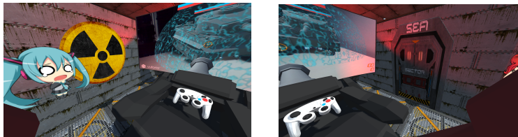
Fig. 2. Left and Right views of the cockpit as seen through the HMD.

Improving on previous works, WAR Bots emphasizes the engagement of both VR and AR within a gaming experience for controlling robots. We extend each medium in the following method: