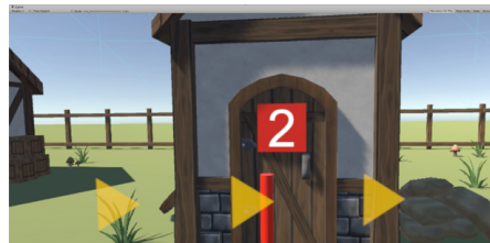
Fig. 2. Rotating direction recommendation guide