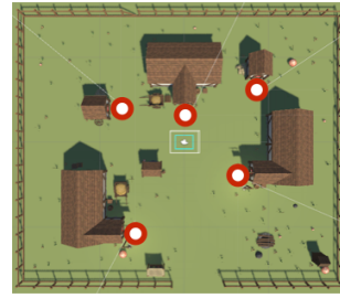
Fig. 4. Positions of check points

Table 1 below shows mean time required for subject to have completed the task and standard deviation. It has been proved that the proposed system requires much longer time compared with a movement approach by keyboard/mouse.