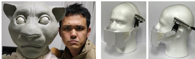
Fig.3. Experimental animatronics mask and sensor unit.

In the future we plan to improve the accuracy of recognizing facial expressions and eye movements with sensors and to actually proceed with the production of an animatronic mask which reflects facial expressions. (Fig. 3).