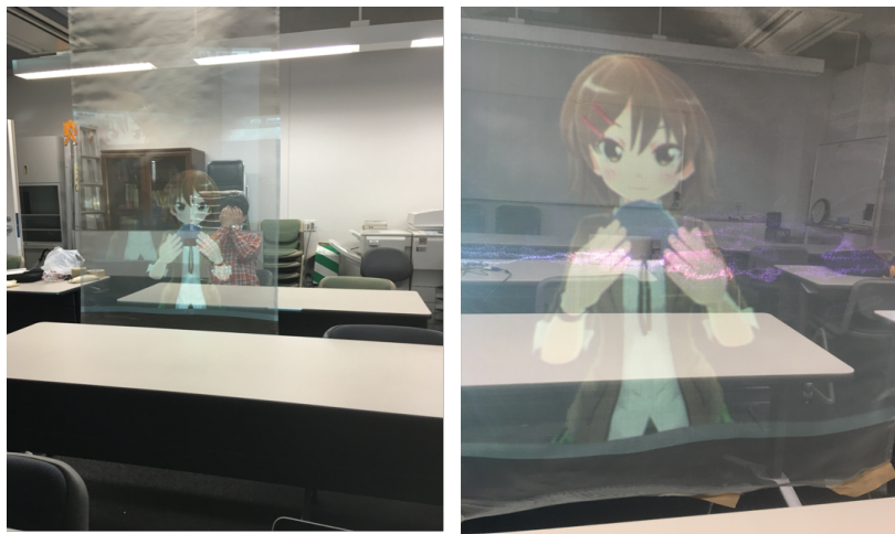
Fig. 2. Projecting the Virtual Partner

If the system requires to wear a wearable device such as a head-mounted display, it makes a user hard to eat and to see, then it makes difficult to improve eating experience. Therefore, the system uses a projection technique to present the virtual partner in the real space. The screen of the mesh fabric is adopted for the projection to make the partner to be more three-dimensional in the real space as shown in Fig. 2.