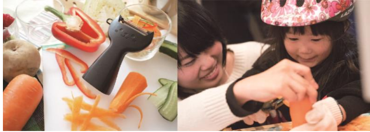
Fig. 1. Overview of TamaPeeler: Left) TamaPeeler, Right) Appearance in experience