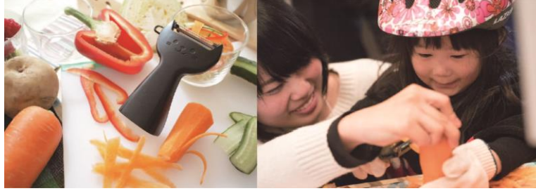
Fig. 1. Overview of TamaPeeler: Left) TamaPeeler, Right) Appearance in experience