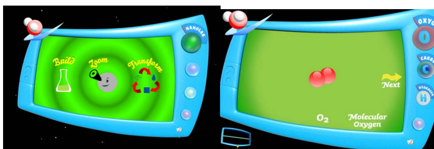
Fig 2 Molecularium Kidsite Nanolab screen and example O 2

interact with numerous examples of chemical concepts at all three levels of chemical thinking, that is, the molecular, symbolic and macroscopic. The chemical conceptual categories of molecules and atoms, and their interrelationships, based on the proposition that 'molecules are built from atoms', are instantiated in the playing.