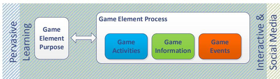
Figure 1 – Pervasive & Social SG element methodological approach.

All of these elements can be described in terms of Purpose, Process and Structure, in the sense that SGMs elements are designed for a reason and have a purpose connected to a gaming and learning experience [6, 7]. This purpose is generally achieved through a process in which activities, information or events represent the structural tangible elements of the overall element described (Figure 1).