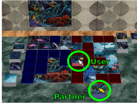
Fig. 1. Snapshot of the system highlighting the players pointers during a KM game session.