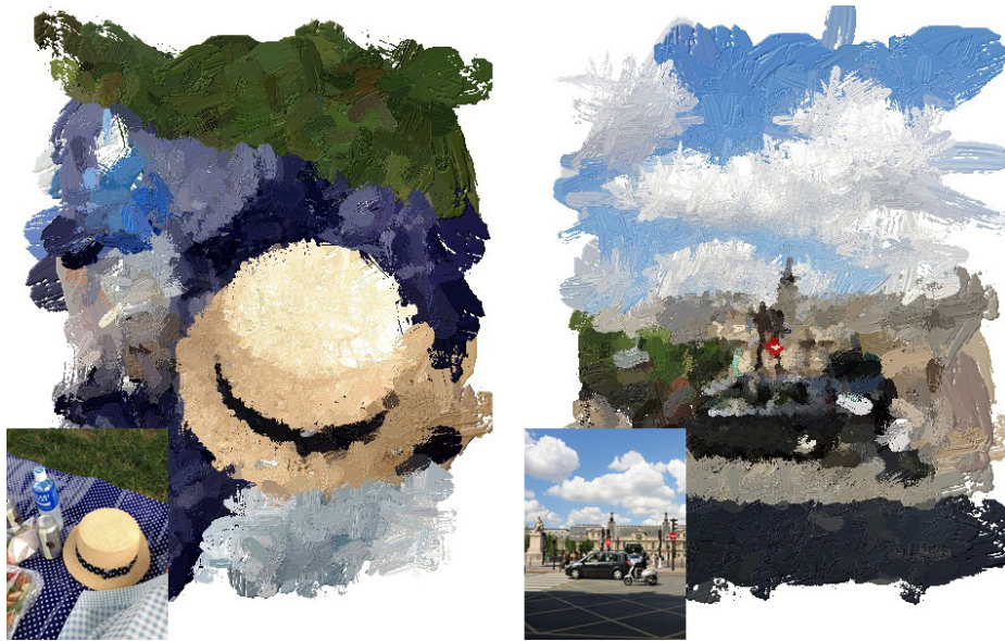
Fig. 3. Various results from the proposed interactive method.