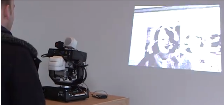
Fig. 2. A person interacting with [self.]

Sound output comes from the speaker mounted on top of the projector, using Csound as the audio engine. In order to make the sound output more life-like and with a character corresponding to the person who taught the given word, the sound is transformed using granular [1] and spectral 5 transformation techniques. These transformations are subtle, with the goal of providing a gentle coloring and personalization of the sound, similar to what the ESN does in the video domain.