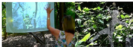
Fig. 1. Presence by Laura Dekker [7]

In "Presence" [7], screens are displayed in a park and require an audience to move or dance in front of them provoking with their movements layers of video to reveal or hide (Fig. 1).