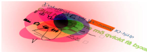
Figure 2: Example of a rendered picture following the canvas fingerprinting test instructions.

the browser to use one of its fallback fonts by asking for a font with a fake name. Depending on the OS and the fonts installed on the device, fallback fonts may differ from one user to another. For the second line, the browser is asked to use the Arial font that is common in many operating systems. Then, we ask for additional strings with symbols and emojis. All strings, with the addition of a rectangle are drawn with a specific rotation. A second set of elements is rendered with four mathematical functions: a sine, a cosine and two linear functions. These functions are plotted on a specific interval and using the PI value of the JavaScript Math library as a parameter. The third set of elements consists in drawing a set of ellipses. These figures are drawn with different colors and with different levels of transparency. Since filters for opacity change among browsers, it creates differences between them. The last element is a centered shadow that overlaps the canvas element. Figure 2 displays an example of a canvas rendering following the instructions of our script.