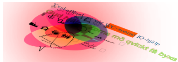
Figure 2: Example of a rendered picture following the canvas fingerprinting test instructions.

IQ-hjälp ” and “ Gud hjälpe Zorns mö qvickt få byxa ”. They contain most of the letters found in the alphabet and we added special characters in them. For the first string, we force the browser to use one of its fallback fonts by asking for a font with a fake name. Depending on the OS and the fonts installed on the device, fallback fonts may differ from one user to another. For the second line, the browser is asked to use the Arial font that is common in many operating systems. Then, we ask for additional strings with symbols and emojis. All strings, with the addition of a rectangle are drawn with a specific rotation. A second set of elements is rendered with four mathematical functions: a sine, a cosine and two linear functions. These functions are plotted on a specific interval and using the PI value of the JavaScript Math library as a parameter. The third and final set of elements consists in drawing a set of ellipsis. These figures are drawn with different colors and with different levels of transparency. Since filters for opacity change among browsers, it creates differences between them. One of these ellipsis is overlapping the canvas element, and it is filled with a transparent radial gradient. Figure 2 displays an example of a canvas rendering following the instructions of our script.