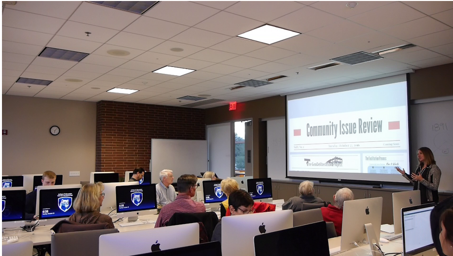
Fig. 3. Face-to-face meeting on Day 1

The community issue used in this study is inflationary tax indexing . The proposal is that real estate tax should be increased by at least inflation every year just to keep pace with the cost of providing services to the Borough . We recruited fourteen participants as the citizen panel. Most of them were recruited via mailings that were sent at random based on the addresses provided the borough office. Three of them from specific student organizations were recruited via targeted email. The three students rent in the borough. The rest are homeowners. There are also four subject matter experts involved. Two of them are proponents that support the inflationary tax indexing, and two are opponents against the issue.