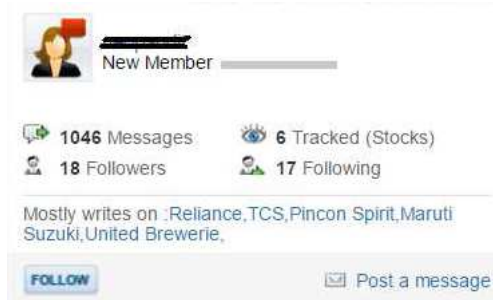
Fig. 2. A general format of Member information on mmb.moneycontrol.com

message text was tokenized and Part of Speech (POS) tagging was done. The verbs from those tagged words were taken and if they match Buy, Sell, or Hold , then they were associated with the tag. In some messages, users have not directly written whether to Buy, Sell or Hold but they have given the next price (target) of the stock. We have extracted the current price of the stock using nsetools which is a Python library for extracting real time data from National Stock Exchange (India). If the current price of the stock is less than the target given by the user then the suggestion is taken as Buy else Sell . After extracting the suggestions of the user from their messages, we created a network of users and their suggestions. A sample network showing the interaction of different users and their suggestions such as Buy, Sell, or Hold is shown in Figure 3.