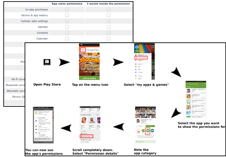
Fig. 1. Step-by-step instructions for permission retrieval given to the subjects (lower right) and one of the ten questionnaire pages for capturing the app permissions and settings preference (allow/reject) in the upper left.