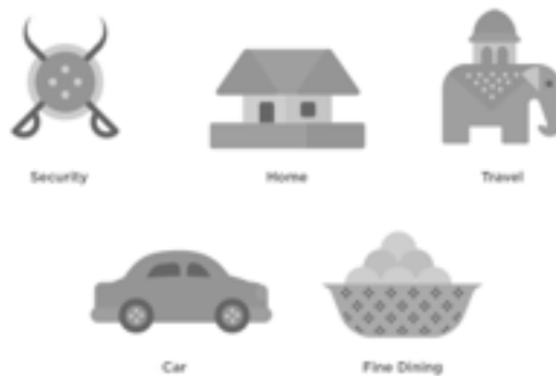
Fig. 4. Few examples of icons from the quietly Indian set

We focused on creating a visual language to resonate with the sentiments of the users. We wanted to breakaway from the traditional image of a bank. From serious and transactional to more playful and familiar. We created over 500+ icons and illustrations for the IDFC bank. These were based on being quietly Indian, with the essential Indian ness but not being loud about it. These were inspired by our rich folk art and diverse culture. As shown in example in Figure 4.