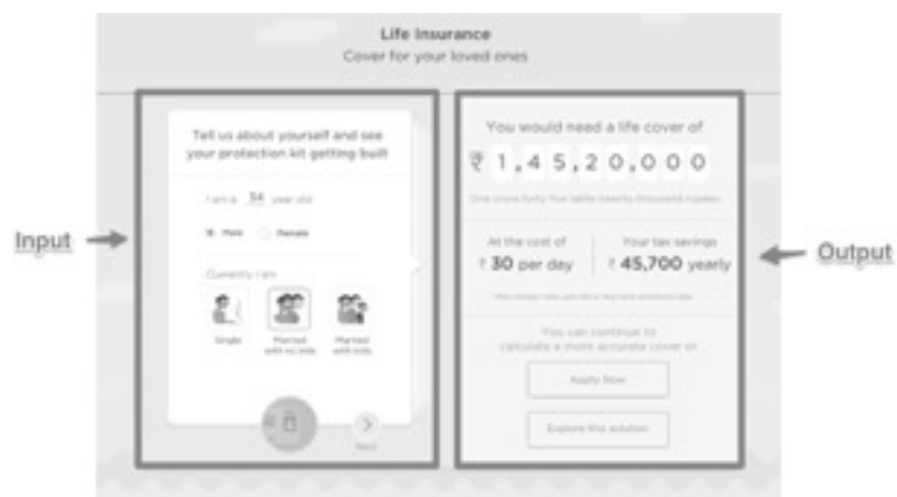
Fig. 1. Input and output in personal insurance journey for desktop web

Profiling requires form filling which involves several inputs and multiple steps. In order to persuade and motivate the user to keep providing information, we needed to bring out the value in their actions. We did this by showing the user relevant information for each step. This information was persuasive and insightful in nature. For example: In the insurance journey, a user gets a quote for his life cover in the first step itself. For the next steps, if the user chooses to secure his family and their health, the cover amount increases with each step. This creates reasoning to why that extra cover is required and user is persuaded to finish all the steps. As shown in example in Figure 1.