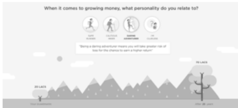
Fig. 2. Interactive graph with daring adventurer as personality type

For banking solutions like wealth management, that needed educating the user about the investment market behaviours, risk capacity, etc. it was necessary to use stock market based statistical graphs. For each personality of investor the predicted investment growth graph will be different. These graphs can be difficult to understand for a new user. New users don't understand which personality type they belong to. We used real life metaphors to simplify the understanding of these personalities and the graphs. The actual meaning of the graphs is revealed to the user as they start interacting with the graph and explore how different personality types affect investment graphs. As shown in example in Figure 2.