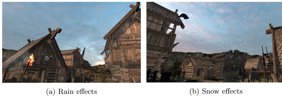
Fig. 3: Enhanced Viking Village VR scene with different weather effects.

Viking Village In the viking village simulation (VV) we took one of Unity's standard environments called "Viking Village" from the Unity asset store and enhanced it with visual, auditory, and vibrotactile rain and snow effects.